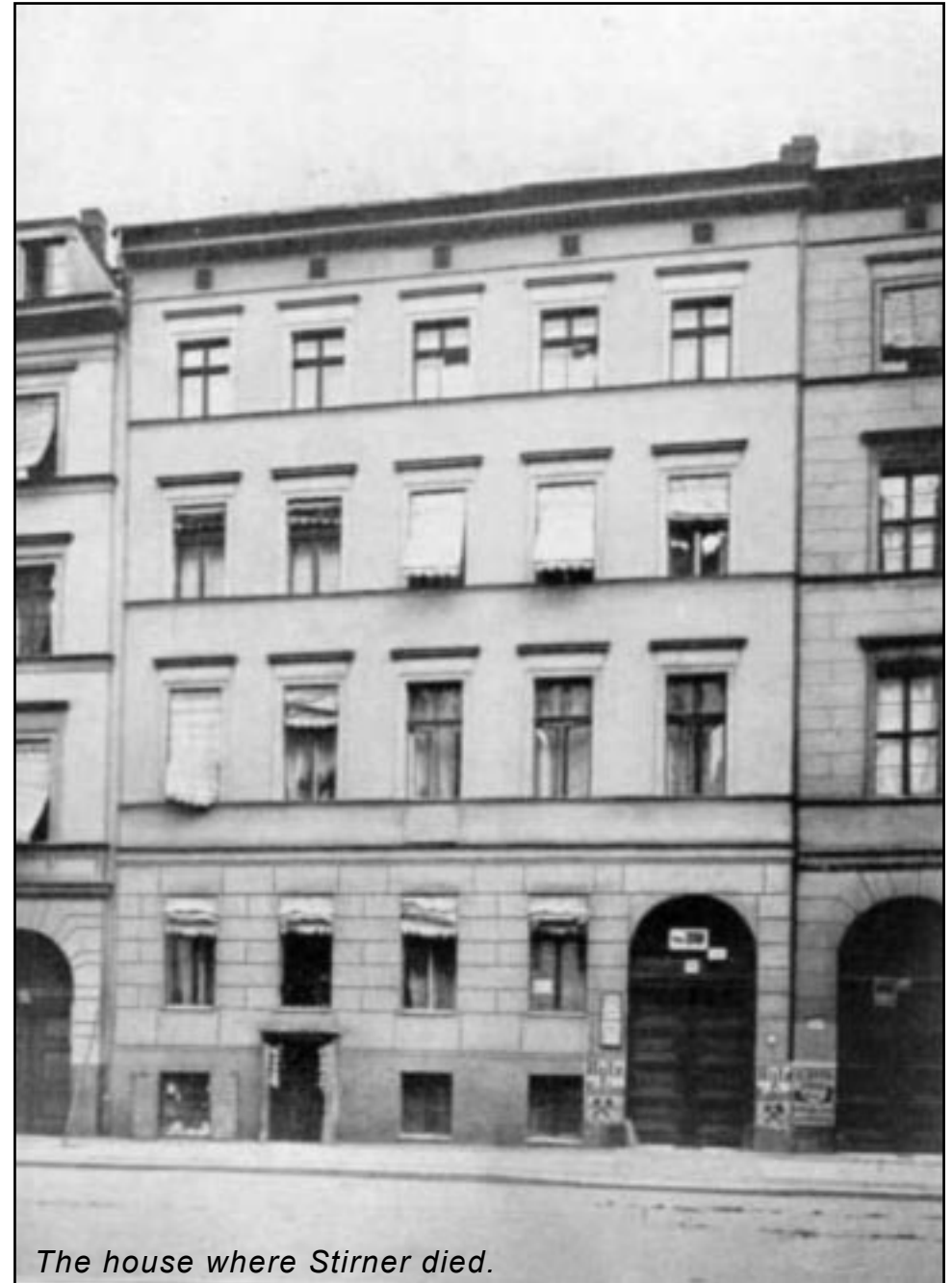
The house where Stirner died.